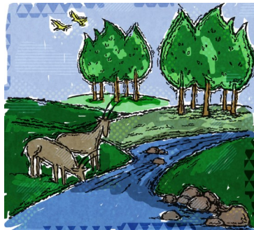
Answer: D & F (see Genesis 2:10-14)